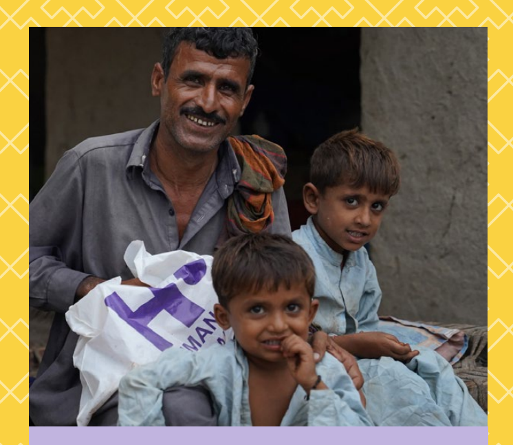
In Pakistan, we distributed 4,020 Qurbanis , each weighing 6.6lb , supporting 20,100 people .