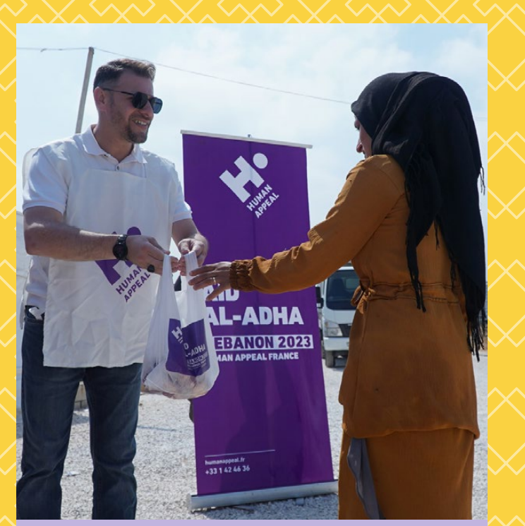
In Lebanon, Human Appeal distributed 1,860 Qurbani portions to Syrian, Palestinian and Lebanese families.