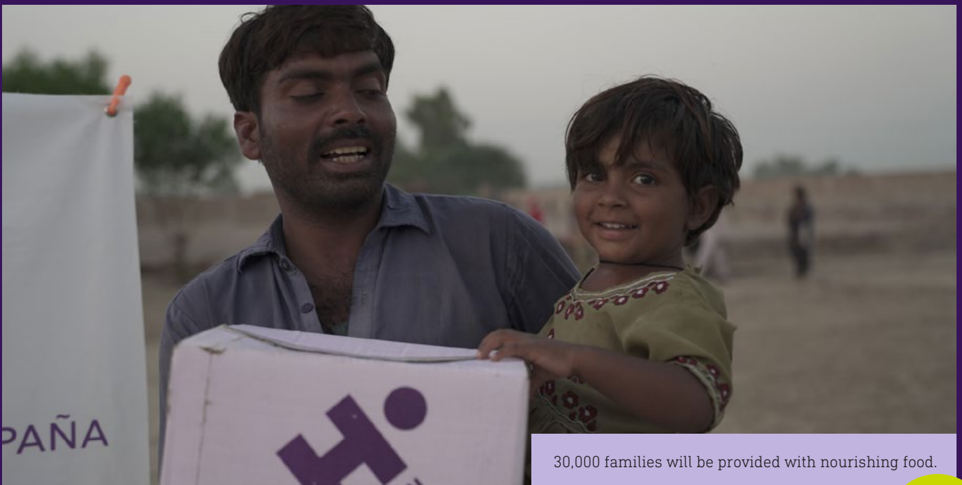
30,000 families will be provided with nourishing food.