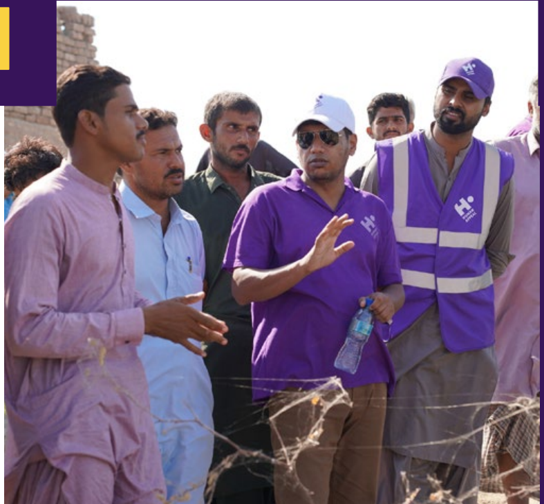
Conversation with residents to see what they need.

Human Appeal Pakistan team visited a flood-hit village in the Dadu District of Sindh, to assess the damage and determine the best ways to help meet survivors' needs. The team met with locals to discuss the planning for new home construction for residents who are now forced to live on the roads.