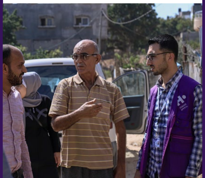
Consulting with locals is important before larger projects begin.

In preparation for a project to treat wastewater in the north of Gaza, our team visited the area to map it ahead of the project beginning.