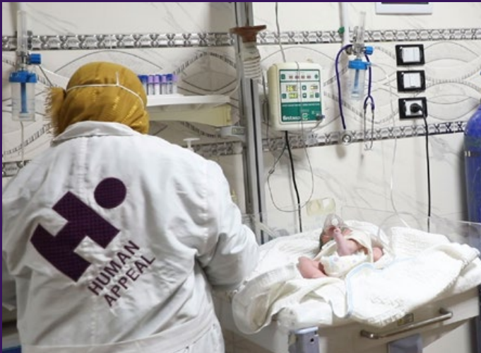
Baby in care at Al Iman Hospital.