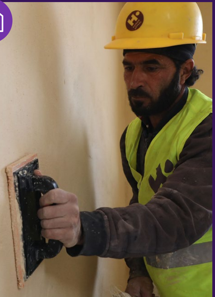
Plastering in progress at Al Yasameen Village.

Construction of the final homes in Al Yasameen Village, Human Appeal's third town for displaced Syrians, has been completed. These homes, designed to accommodate 1,000 Syrian families , are part of Human Appeal's ongoing efforts to provide secure, safe, and dignified shelter for displaced Syrian families, especially crucial as winter approaches. With the completion of the last homes, the focus now shifts to plastering and expanding the sewage system to cover all the residences.