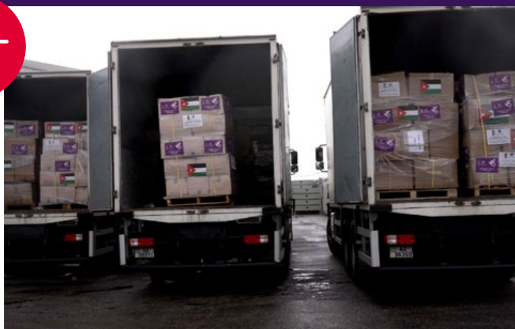
The aid after being loaded onto trucks in Gaza.

In collaboration with Jordan's Hashemite Charitable Organization, our humanitarian aid plane touched down in Gaza. Containing 45 tons of essentials - medical supplies, clothing and food - it will provide vital support to innocent civilians.