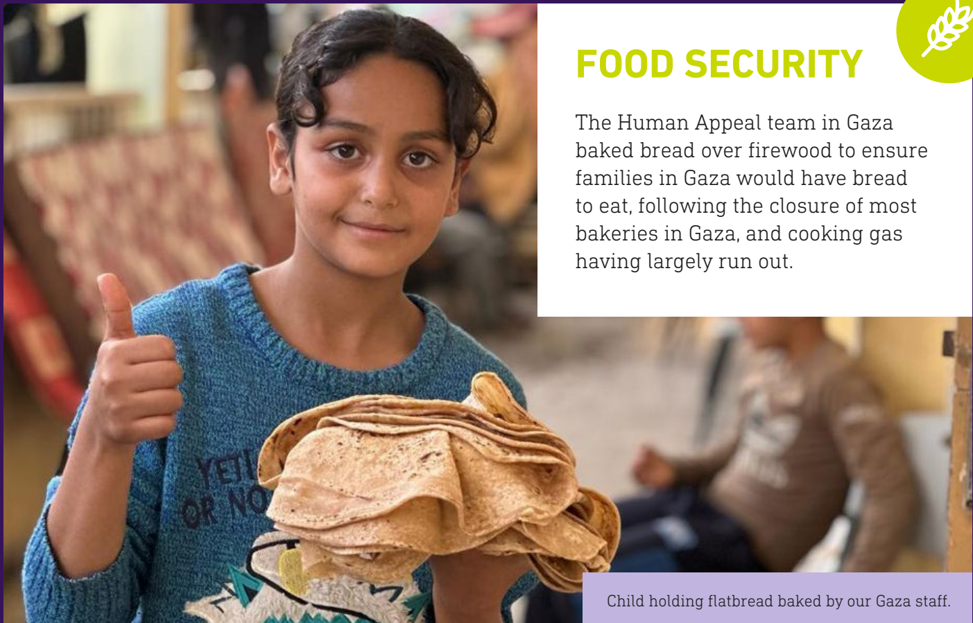
Child holding flatbread baked by our Gaza staff.

The Human Appeal team in Gaza baked bread over firewood to ensure families in Gaza would have bread to eat, following the closure of most bakeries in Gaza, and cooking gas having largely run out.