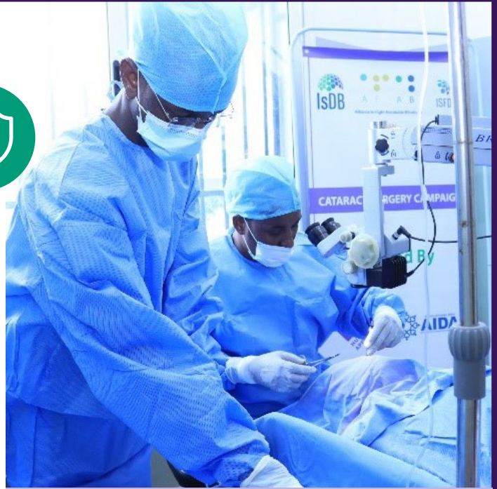
Cataract surgery in process in Somalia.

We conducted a cataract treatment campaign across three regions of Somalia – Mogadishu, Barawe, and Luuq. Through comprehensive screening, consultations, and treatment, we reached 6,790 patients with eye-related illnesses. Among them, 2,012 patients underwent successful cataract surgeries, contributing to the restoration of sight and enhancement of their overall quality of life.