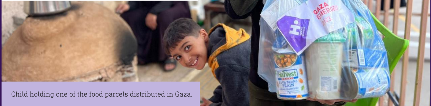
Child holding one of the food parcels distributed in Gaza.

On the 6th December, 1,000 food parcels were delivered to Khan Yunis in the south of the Gaza Strip where they were distributed amongst displaced families.