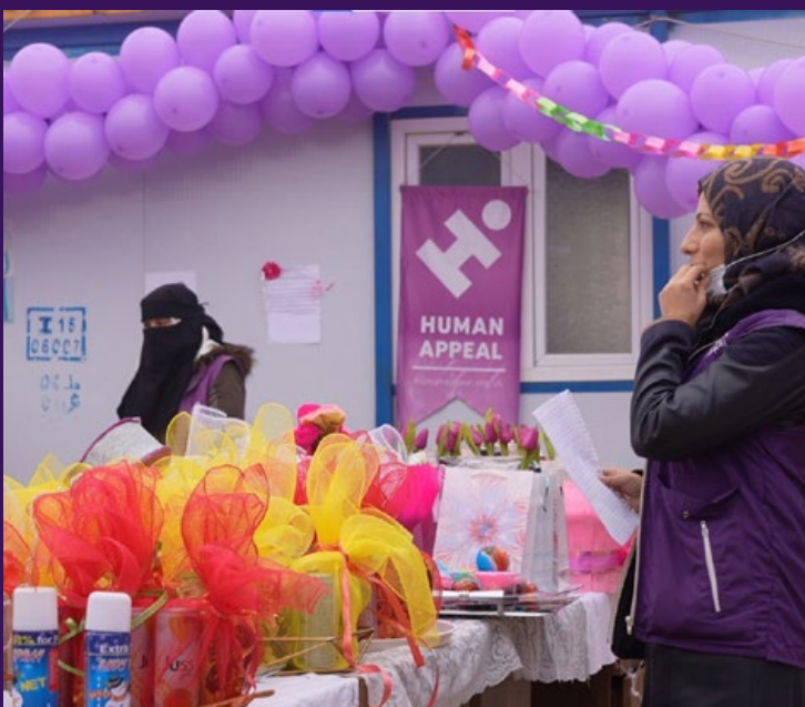
The campaign in progress.

Human Appeal orchestrated a campaign in Al Zohoor village, emphasizing the significance of addressing violence against women. The campaign ran for 16 days, ending on the 10th of December, and included various activities and silent plays, featuring volunteers from the community and employees. Al Zohoor village, our second constructed village for displaced Syrians, serves as a testament to our ongoing commitment to providing secure and dignified shelter for those in need.