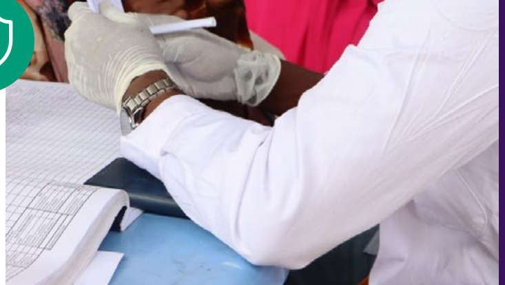
Staff at mobile clinic listening to the issues of a patient.

Human Appeal Somalia conducted a one-week long mobile clinic project in Kahda and Daynile displacement camps, providing primary health care to 617 patients who were in critical need of medical assistance but had faced barriers in accessing it before.