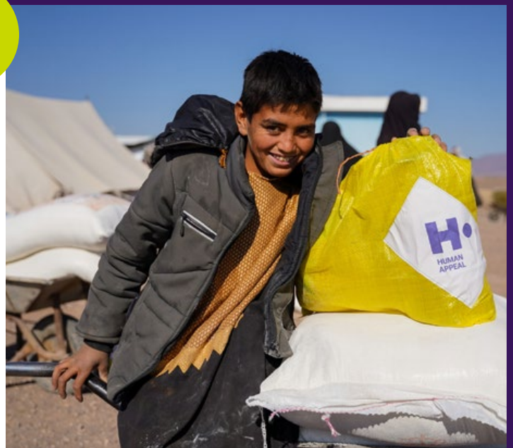
Child with a wheelbarrow containing wheat flour.

Despite ongoing efforts to recover from the October earthquake, numerous individuals in Afghanistan continue to grapple with significant challenges in obtaining essential food and hygiene resources. On December 1st, Human Appeal distributed food packs to 300 families in the villages of Ghandha and Chasmah in the Herat region. Each food parcel included 100kg of wheat flour, 8kg of grains, 5kg oil and 1kg salt , enough to last a family of six for a month.