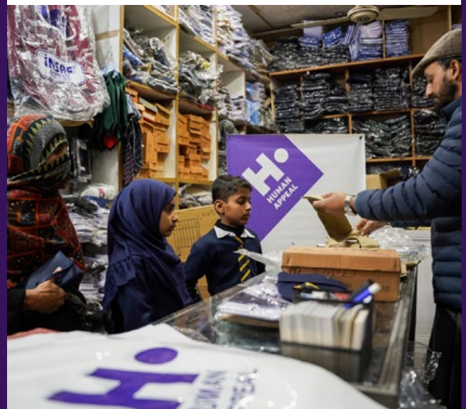
Children trying on their new uniforms at a shop.

Human Appeal is providing Back to School Kits to 475 children in Taxila and Islamabad in Pakistan. The kits consist of new uniforms, complete with school shoes. For many families facing financial constraints, providing uniforms for their children is a challenge, making this initiative a significant relief in easing the burden of educational expenses.