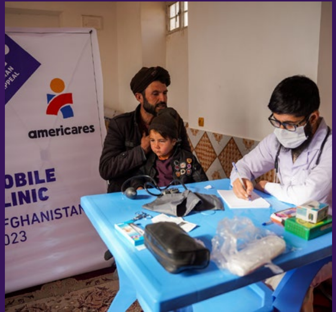
Doctor making notes about a child patient.