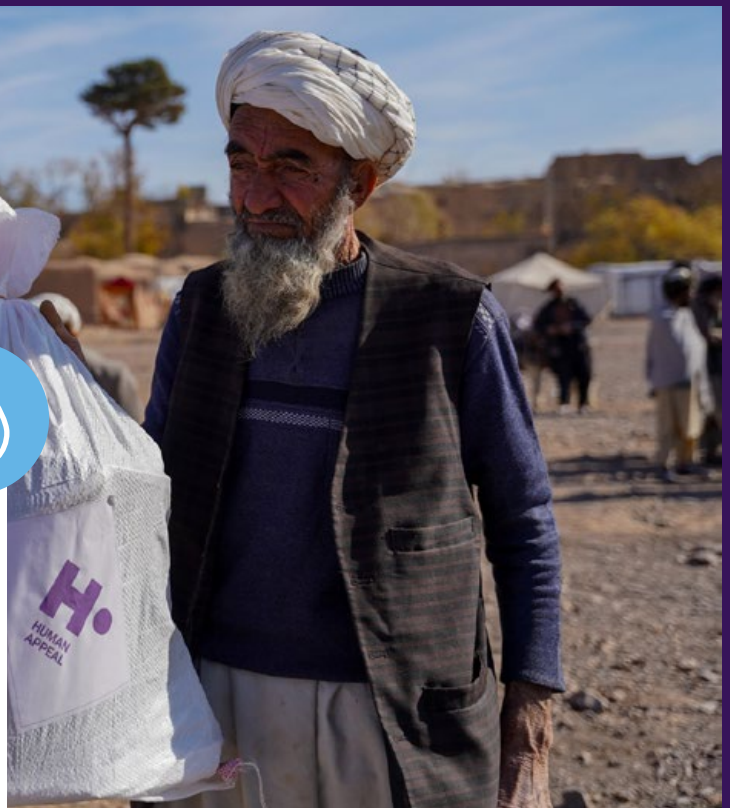
Hygiene kit being given to an older man.

On the 11th December, Human Appeal distributed 300 hygiene kits to the residents of Chashma Yaqoob, a village in the Herat region in Afghanistan. These hygiene kits included essential items that will help families stay clean, improving their health and dignity.