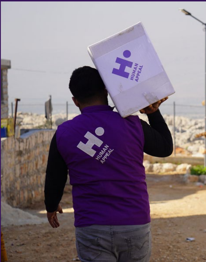
Food parcels being transported into the village.

Human Appeal provided food parcels to the residents of Al Zohoor village who were impacted by the earthquake in 2023. Despite the passage of months since the earthquake, numerous individuals are still grappling with the aftermath, having lost their homes and personal belongings. Al Zohoor, our second constructed town for displaced Syrians, accommodated 1,000 families within 100 hours of the devastating earthquake in early 2023. The distribution initiative commenced on December 19th, reaching 200 families . Each food parcel is equipped with essential items like lentils, rice, bulgur, pasta, dates, oil, olives, and flour, ensuring that a family has sufficient provisions to last for a month.