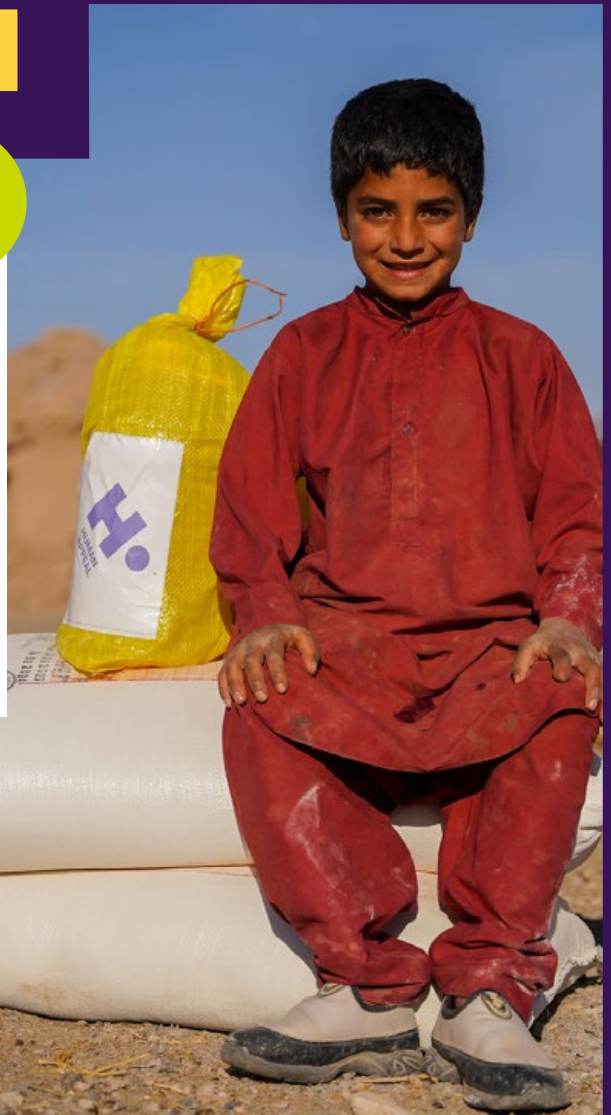
Child sitting with his food pack.

Human Appeal Pakistan distributed 150 food packs across the villages of Chashma Balocha & Kotti Dasht in the Herat region in Afghanistan. Each food parcel includes 100kg of wheat flour, 8kg of grains, 5kg of cooking oil and 1kg of salt , enough to last a family of six for a month, taking another step closer to fulfilling our goal of distributing 650 food parcels in villages affected by the series of earthquakes.