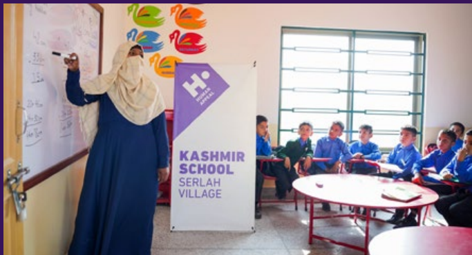
Class in session at the new school.