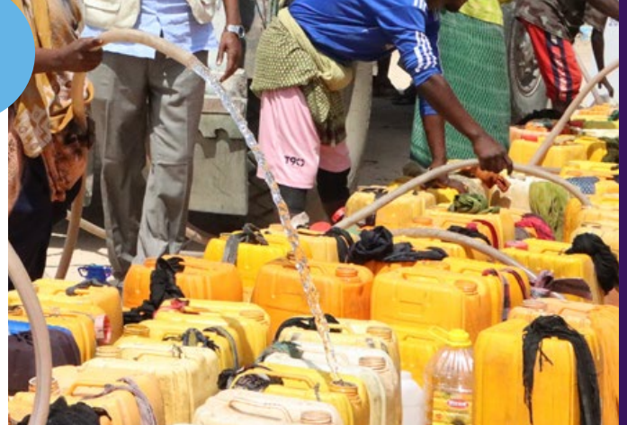
Families filling their water tanks in Deynile.

Human Appeal Somalia is providing clean water to the community of displaced families in Deynile via water trucking. Within a month, 128 households will see a significant enhancement in their access to clean and safe water, thereby contributing to the improvement of their health and overall well-being.