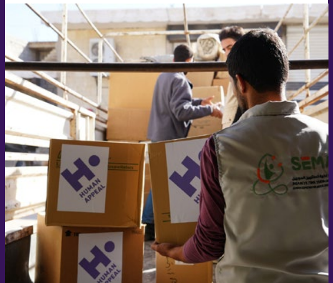
Medical supplies being removed from the truck for distribution.

Human Appeal has successfully distributed medical supplies from Globus Relief across several medical centres in multiple areas of north-western Syria. These supplies play a crucial role in addressing the scarcity of medical items in hospitals and health centres, which are grappling with increased demand during the winter season.