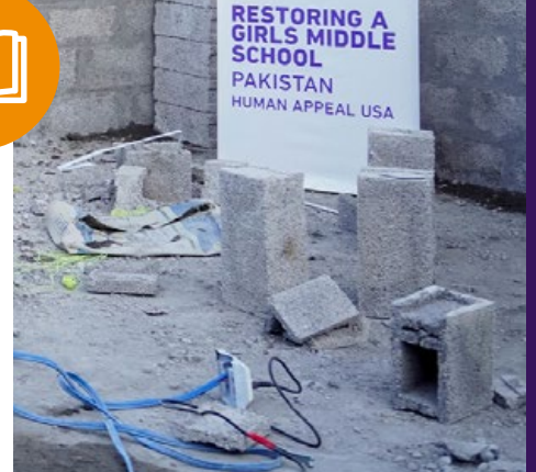
Work on the school in progress.

Human Appeal is working on restoring the middle school for girls in the village of Chitratopi, Kashmir in Pakistan. The school was destroyed by an earthquake in 2005, and only partially repaired. Human Appeal has begun a project to fully restore the school, with 14 classrooms , along with bathroom facilities. This initiative will enable the local children to study in a secure and comfortable environment, eliminating the need for outdoor classroom sessions.