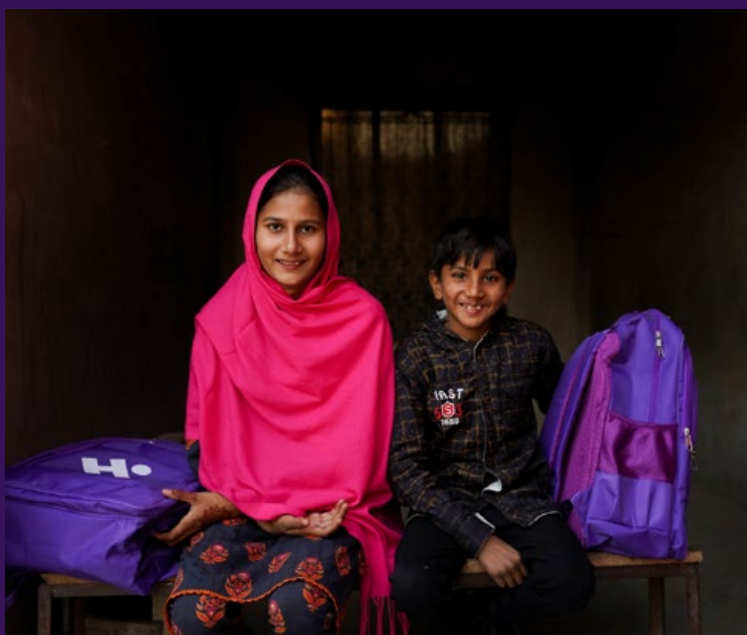
Children sitting with their Back to School bags.

Human Appeal provided Back to School kits to 300 children about to return to school after the winter break in the region of Faisalabad in Pakistan. Each Back to School kit is a brand new school bag, containing notebooks, pens, pencils, a geometry set, coloured pencils and a water a bottle. These kits will assist low-income families in ensuring their children can attend school without facing the difficult choice between purchasing food or essential school supplies.