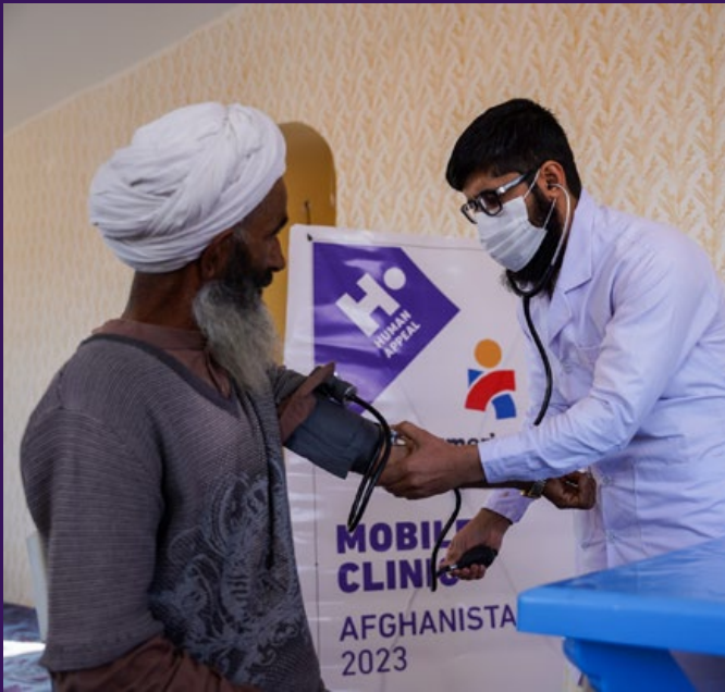
The mobile clinic providing service to older man.