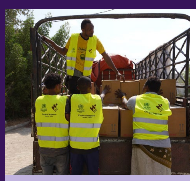
Essential medical supplies being delivered in Yemen.

In response to a notable increase in cholera cases in Aden, Yemen, Human Appeal Yemen collaborated with the World Health Organization (WHO) to provide critical medical supplies to various health facilities in the region. This initiative extended support to institutions such as the Friendship Educational Hospital, Sheikh Othman Health Facility, Al-Buraiqa Health Facility, and the Kabuta Health Facility. The donated medical supplies from the WHO, including oral rehydration solution and 40,000 water purification tablets , are anticipated to benefit approximately 250,000 people . This intervention aims to alleviate the severity and duration of cholera symptoms, contributing to improved health outcomes in the affected areas.