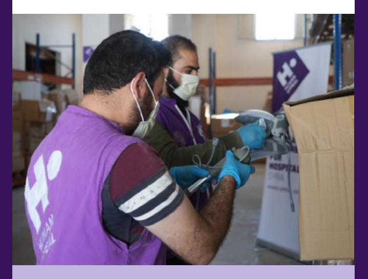
Medical supplies being checked prior to distribution.

Containers of urgently needed medical supplies have been received for distribution to 50 health facilities across Syria. As the conflict persists, these supplies are crucial for providing essential healthcare services to those in need.