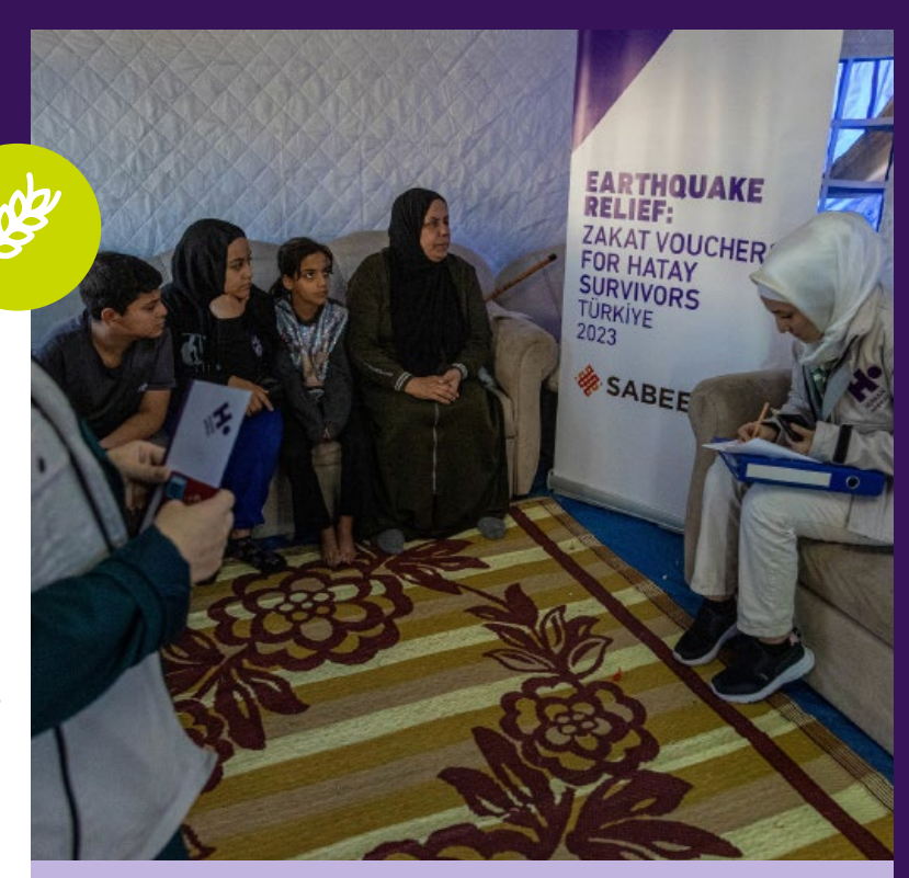
Paperwork being filled prior to voucher distribution.

The aftermath of the earthquake that hit Syria and Turkey earlier this year continues to linger. In Hatay alone, over 600,000 people are grappling with homelessness, triggering economic distress that forces families into a struggle to afford basic necessities and nutrition. In response, Human Appeal stepped in and distributed food vouchers offering crucial assistance in purchasing essential food items.