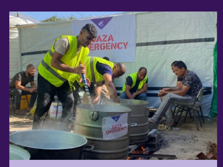
Hot soup being stirred in Gaza before being poured.

As one of the few organisations capable of navigating the intricate challenges of the region, we persist in our vital mission to support and uplift the affected communities. Since the escalation began in October, Human Appeal has been able to assist over 310,370 people in Gaza, thanks to the generous support we have received.