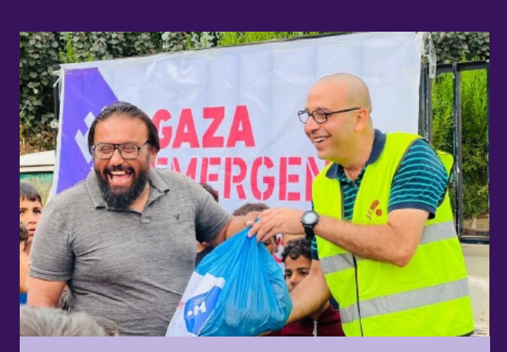
Important food distributions.