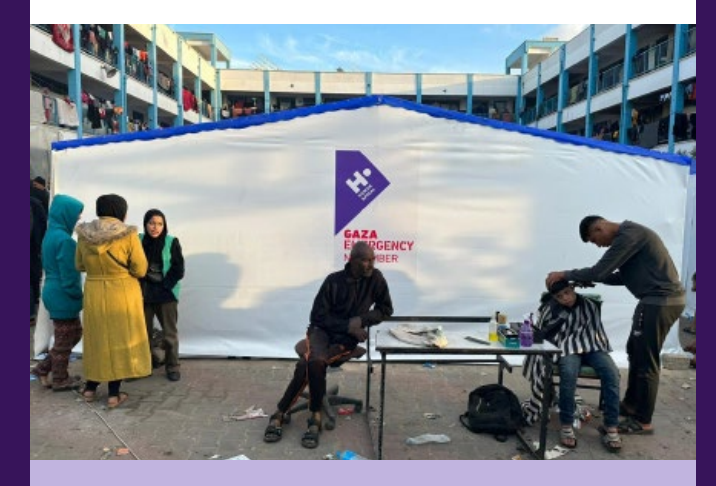
Tents set up in the courtyard of a school.