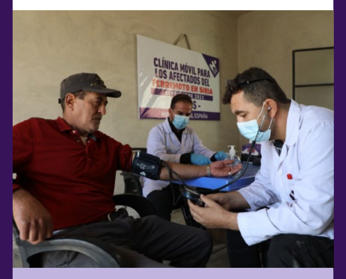
Members of the mobile clinic examining a patient.

Operating in displacement camps and remote areas of northwestern Syria, our mobile clinic is making a difference. With a dedicated general physician attending to around 80 patients daily, our pharmacy ensures free medicine distribution. Additionally, a community health worker addresses malnutrition in women and children by offering vitamins and nutritional supplements, along with a specialised gynecology clinic. Over the course of the month, the mobile clinic has reached