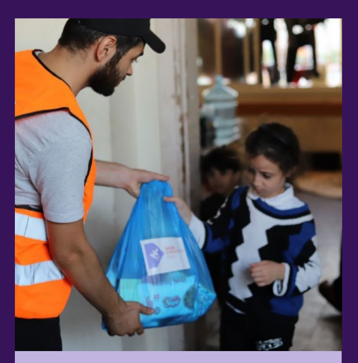
Our team delivering vegetable parcels to people during the emergency.

The dire humanitarian situation in Gaza has persisted for over two months, characterized by devastating conditions. The bombings have claimed thousands of lives, and the crisis is compounded by a nearly complete blockade that hampers the flow of essential humanitarian aid. Despite facing formidable challenges, our dedicated local staff in Gaza persistently carry out their duties every day. Even in the face of personal losses of family and friends during the conflict, they remain steadfastly committed to providing daily assistance.