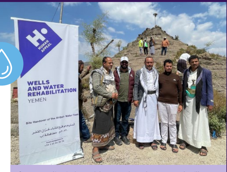
Group standing in front of the area where the water tank will be installed.

The Al Qefr water tank construction is underway near Al-Raheb village. With a capacity of approximately 200m^3 , it aims to provide clean water access, benefiting over 9,600 people and mitigating the risk of waterborne diseases in the area.