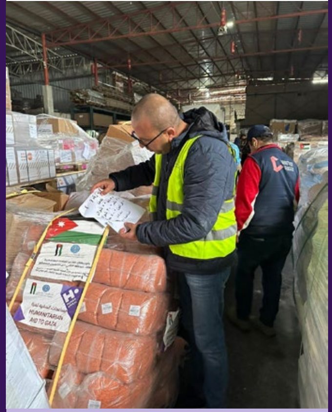
Supplies being organised in the Human Appeal warehouse.

In collaboration with multiple charities, 85 pallets of food supplies have reached the Gaza Strip, where they will be transported to the Human Appeal warehouses and subsequently distributed to families currently residing in the shelter centers within the strip.