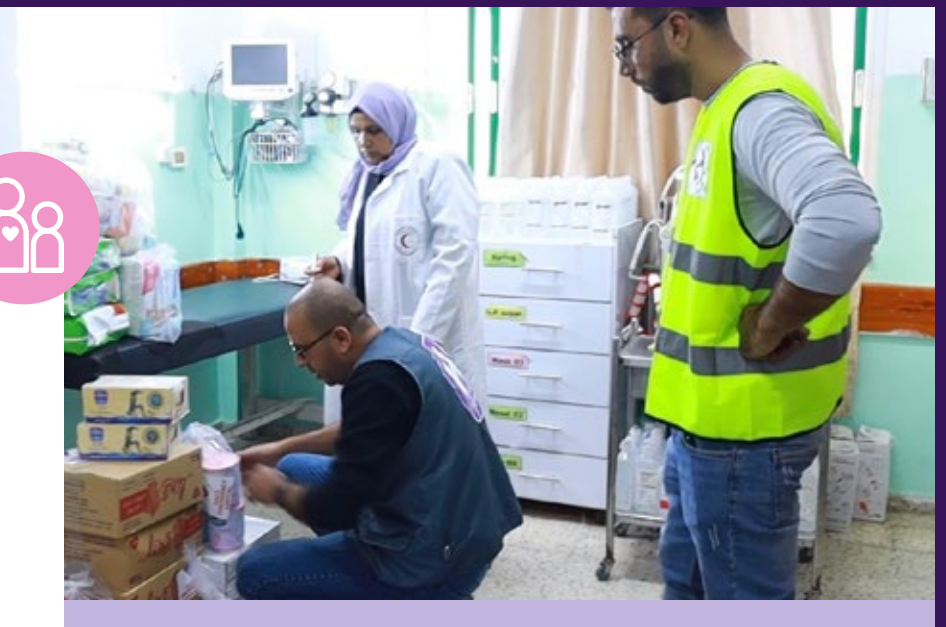
Supplies being organised in Nasser Hospital.

We distributed food parcels, baby formula, Pampers and other necessities to the pediatric and intensive care department at the Nasser Hospital in Khan Yunis.