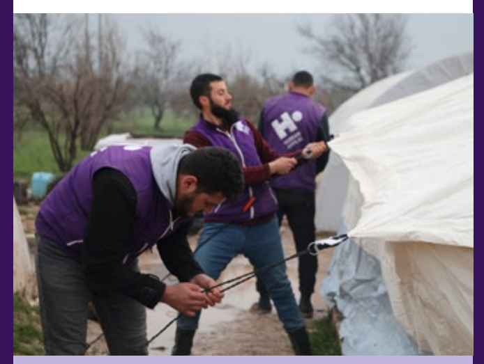
Our Human Appeal team setting up a tent following the rainstorm.

Following a rainstorm that struck several displacement camps in Aleppo in mid-January, damaging and flooding tents, Human Appeal distributed 40 waterproof tents to affected people in the Salet Media camp, and 10 tents in Al Eskan camp.