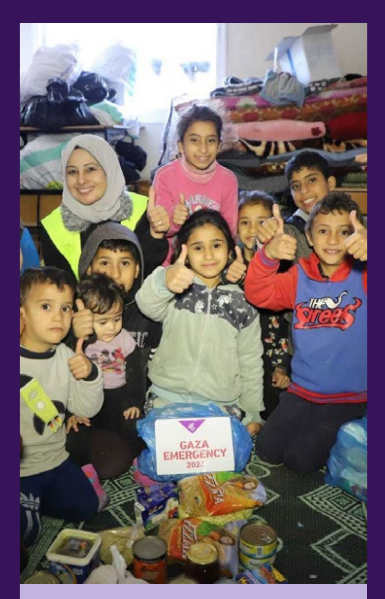
Children at the shelter school with the food parcels.