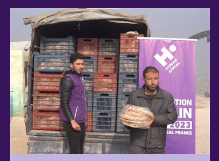
Bread distribution underway in displacement camps.