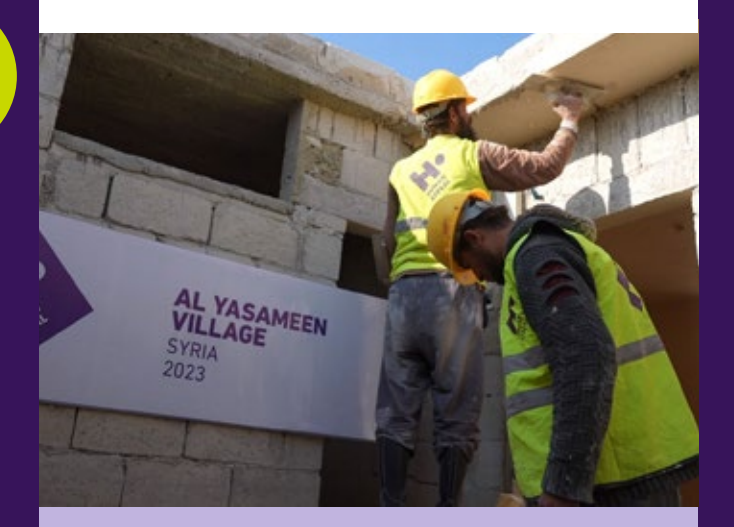
Plastering underway at Al Yasameen.