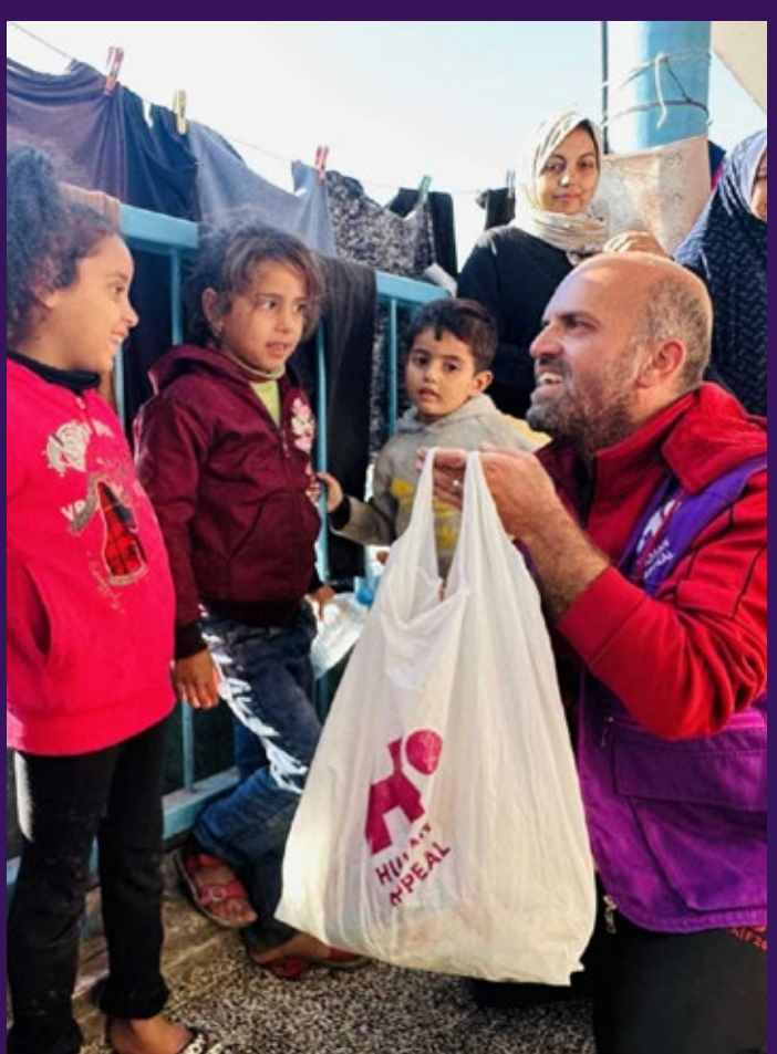
Child being given a bag of new clothes.