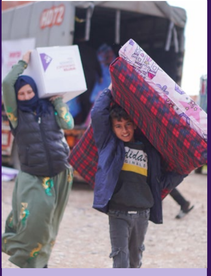
Food parcels and mattresses being carried by a mother and child.