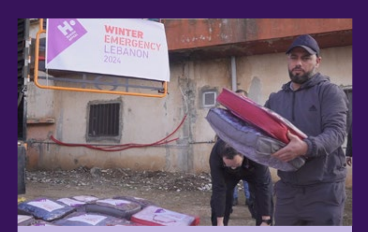
Blankets to help families stay warm in Lebanon.