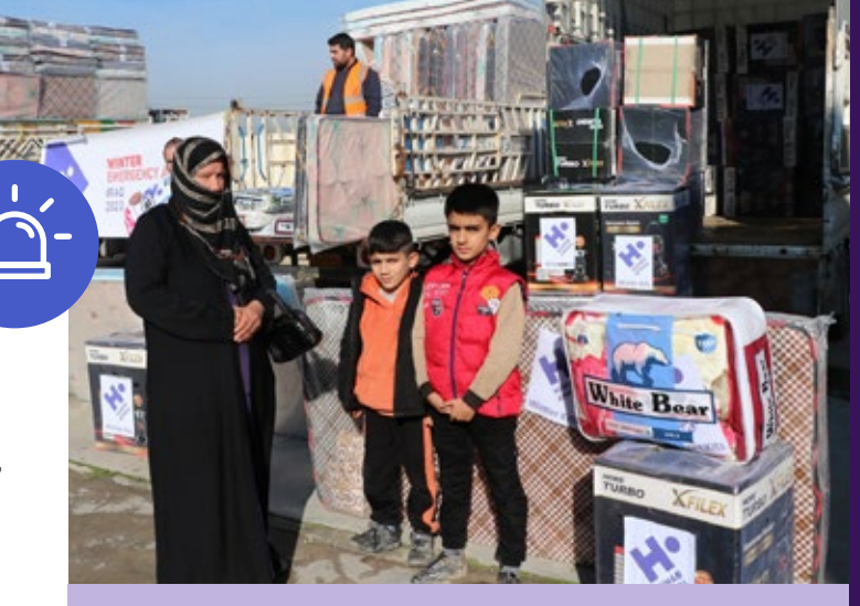
Family standing with the winter items provided.

We provided winter items to 122 orphan families in Iraq, to help them face the challenges of winter. Including a blanket, a mattress and a kerosene stove, these will help families stay warm throughout the winter.