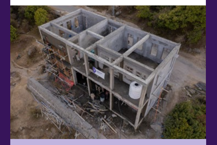
Chitratopi school under construction.

Human Appeal remains committed to the ongoing renovation and enhancement of the Girl's Middle School in Chitratopi. Through our efforts, we aim to provide a secure and conducive environment where local girls can access a high-quality education.