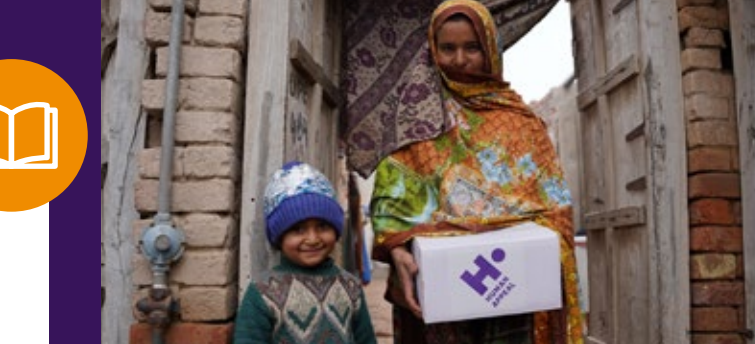
Food pack containing supplies for Pakistan families.