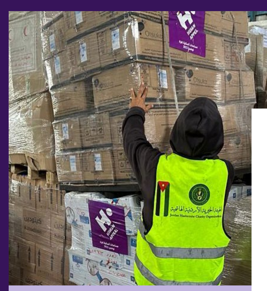
Supplies being prepared for transportation in Gaza.