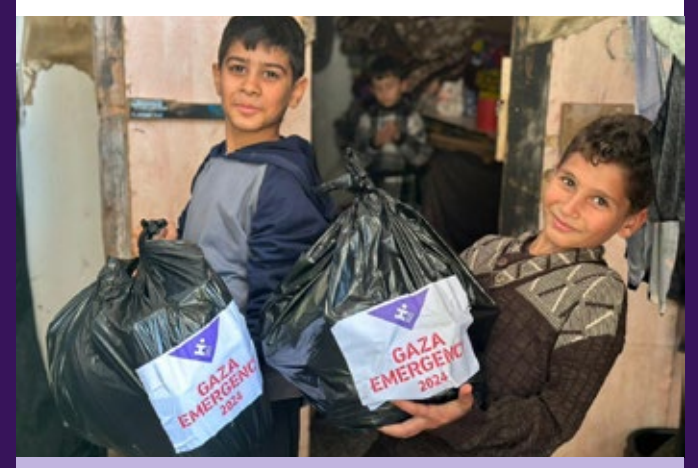
Children holding bags containing food parcels and hygiene kits.

In the region of Deir Al Balah, we distributed 230 food parcels and 230 hygiene kits , supporting families in shelter schools with essential needs.