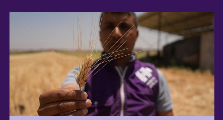
Freshly grown wheat in Syria.