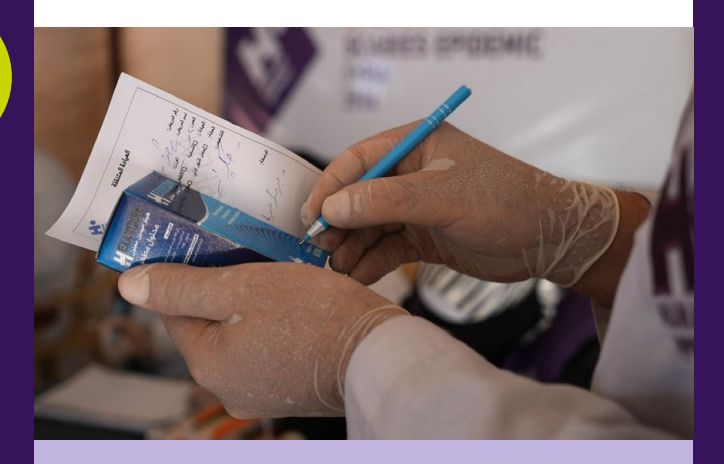
Medical supplies being organised and distributed.

Human Appeal Syria activated an emergency response to a scabies epidemic that occurred in Sham Al Hawa camp. The mobile clinic arrived at the camp, distributing hygiene kits to 32 families, examining 250 people and providing treatment to 138 people, as well as raising awareness of how to identify and prevent further cases of scabies.