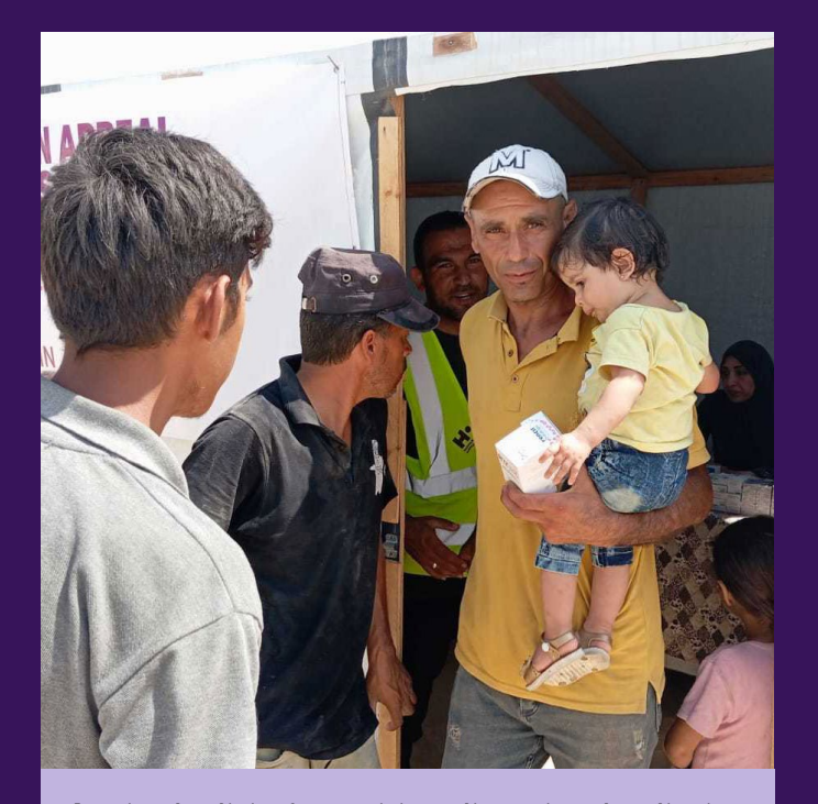
Leaving the clinic after receiving a diagnosis and medication.