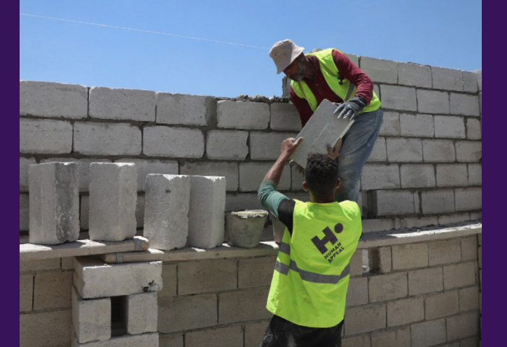
Homes being constructed in Al-Yasameen Village.

Human Appeal provided training to 150 families in northwest Syria on crop cultivation, care, and efficient harvesting techniques. This initiative aimed to enhance the local supply chain and improve food security for each participating family.