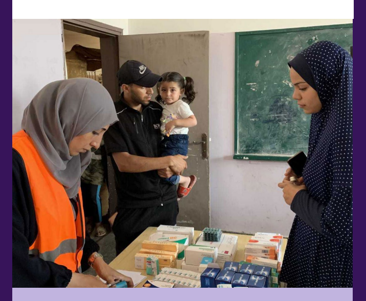
Medication being distributed at the mobile clinic.