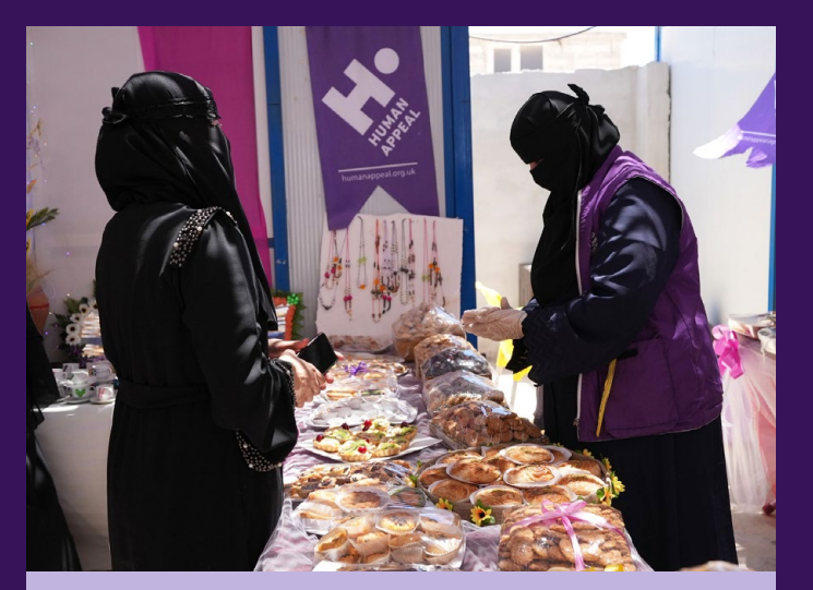
Pastries and accessories on display at the exhibition.