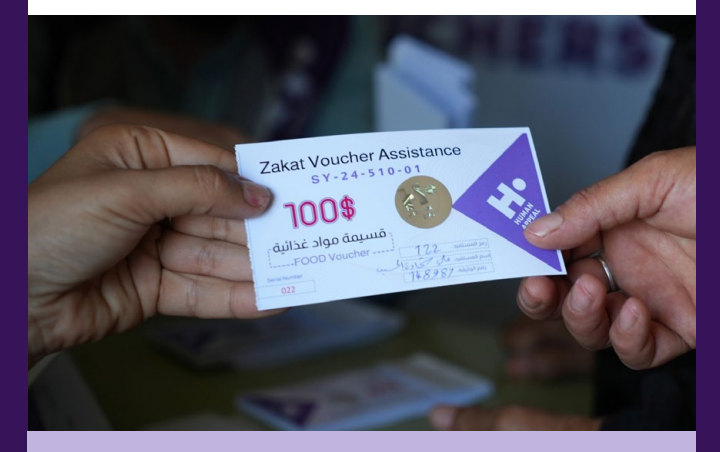
Zakat voucher being provided.

Human Appeal distributed Zakat vouchers worth $100 to 600 families that were affected by the earthquakes in 2023, spread across three displacement camps in northwest Syria. The families used these vouchers to secure foodstuffs for their monthly needs, such as rice, lentils, cooking oil, sugar, tea, eggs, and pasta.