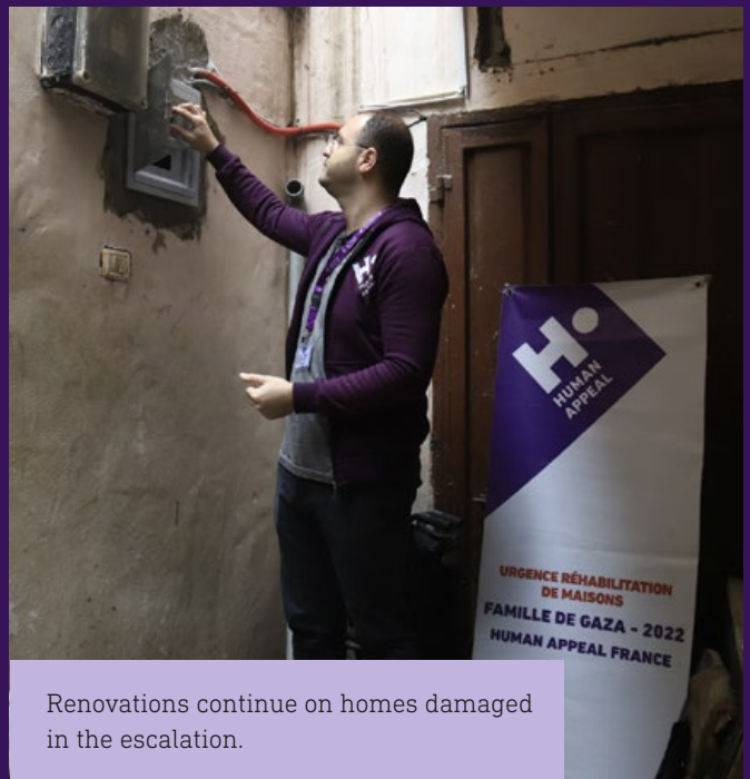
Renovations continue on homes damaged in the escalation.