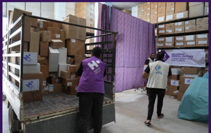
Medical supplies are distributed across northwest Syria.