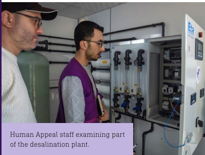
Human Appeal staff examining part of the desalination plant.

Construction on a new water desalination plant began in northern Gaza. This will provide 400 new water tanks to families in Gaza that have been affected by the escalation.