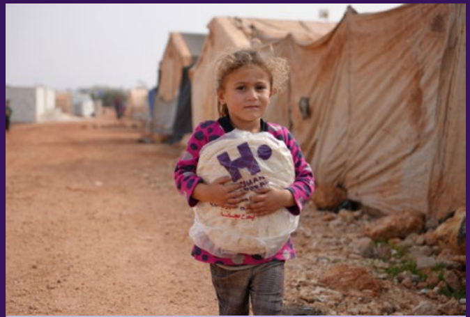
A young girl holds the bread as she takes it back to her family.