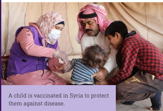
A child is vaccinated in Syria to protect them against disease.

Vaccine teams continue to provide routine vaccinations in remote and hard-to-reach areas, targeting children to help prevent the effects of disease. As many of these children live in unhealthy environments, this is an important way to help preserve their health.