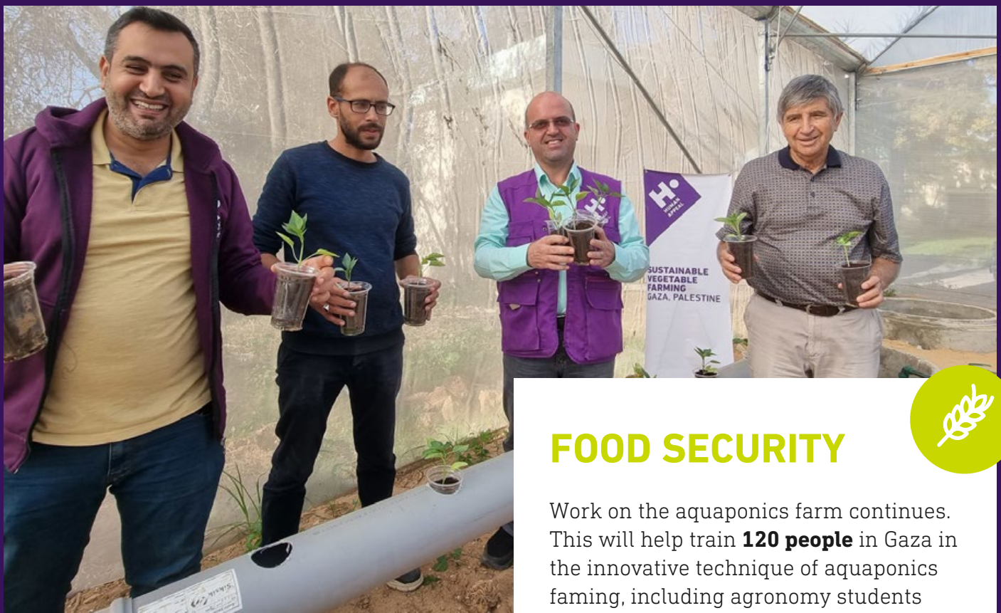
The aquaponics farm is underway.

We have almost finished renovating 70 houses that were damaged in the recent attacks in Gaza.