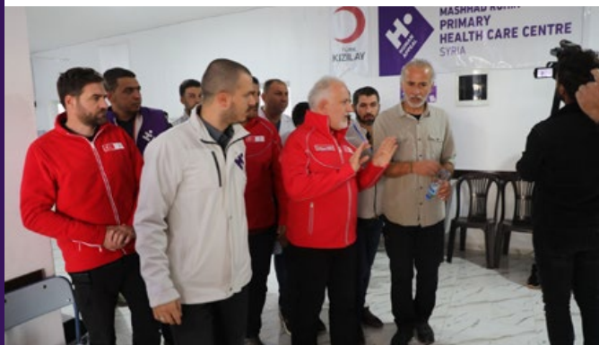
The TRC delegation visits one of the healthcare centres HA supports.