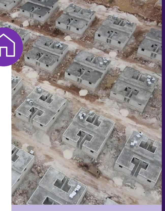
Aerial view of Al Yasameen Village.

Ongoing progress is observed in Al Yasameen village, Maarat Misrin, as groundwork is laid for future construction. The village is set to comprise 250 housing units , each accommodating four homes, resulting in a total of 1,000 houses . This inclusive development plan also encompasses the establishment of a sewage system and a drinking water network. Presently, 680 houses have been successfully completed, with 320 of them having already received roofing. Notably, construction is advancing at a rate of approximately 120 houses per week. The collective efforts aim to create a thriving and sustainable community in Al Yasameen village.