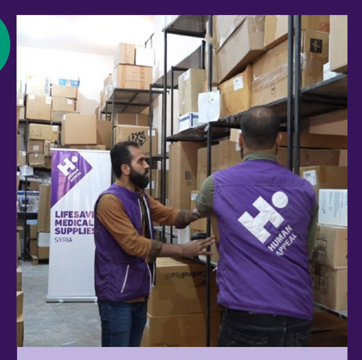
Medical supplies being organised.