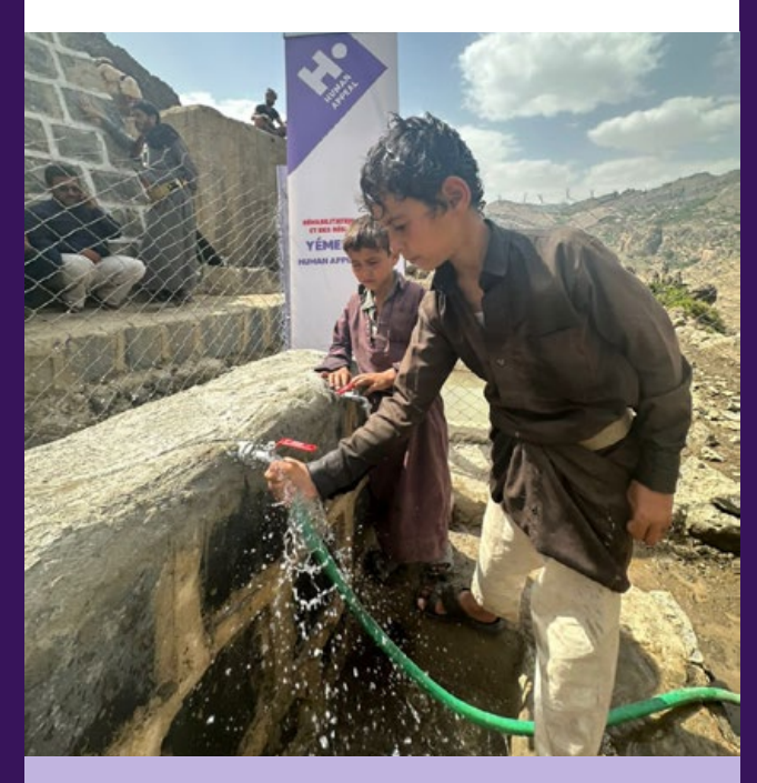
Water well in Yemen.

A solar-powered deep water well was established at a village in the Sanaa Governorate, with 120 solar panels helping to power the well.