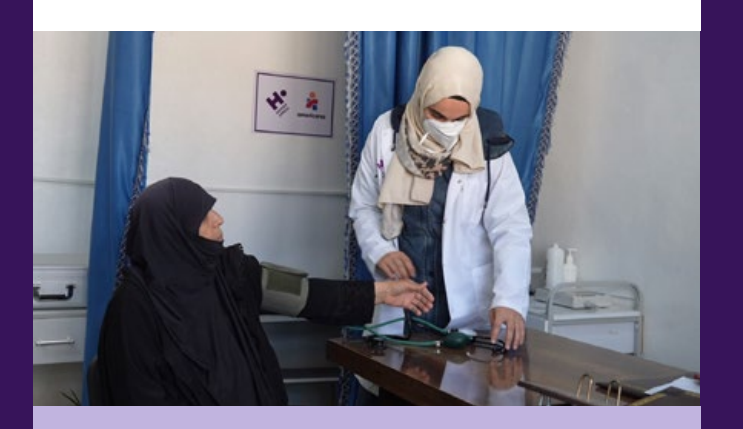
Blood pressure being taken at Al Zohoor Center.

Over the month of September, Al Zohoor Healthcare Center, set up in collaboration with Americares, received approximately 5,659 patients following displacement and heavy bombing in the Idlib region. The team underwent specialised training in Gender-Based Violence and psychological first aid to enhance the provision of psychological support services to individuals affected by these challenges.