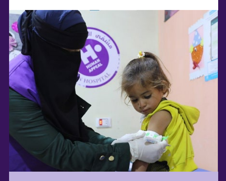
Child being examined at Al Imaan.

Al Imaan Hospital delivered 354 babies conventionally over the course of October, and performed 73 Caesarean surgeries . It also provided care to 5,644 beneficiaries , following the closure of several other hospitals in the area. An expansion of the hospital is also being planned.