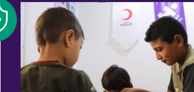
Children in the play room of the health center.