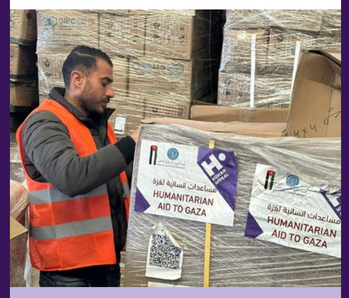
Staff checking medical supply boxes.

Through our partnership with JHCO, we swiftly provided vital medical supplies and medication to Al Awda Hospital in southern Gaza. Our support aims to help the hospital save lives during these turbulent times.